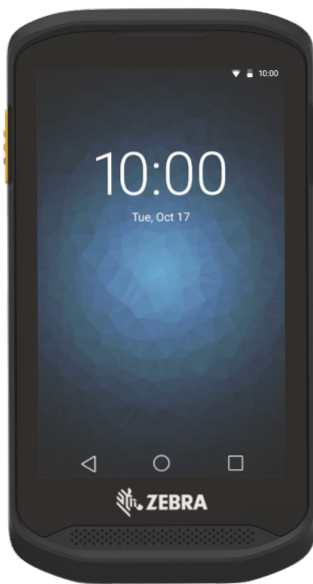
Mobile Computer Featuring Integrated Barcode Scanning