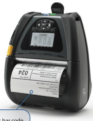
Direct Thermal Mobile Printer with Bluetooth

Label includes bar code, date, time, and user name.